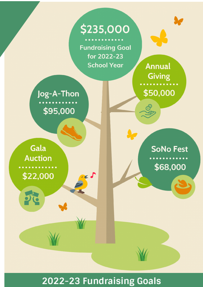
2022-23 Fundraising Goals

Learn more about the Annual Giving Campaign at https://mckinleyptc.org/fundraising/annual-giving-campaign/ or email us at McKinleyPTCFoundation@gmail.com